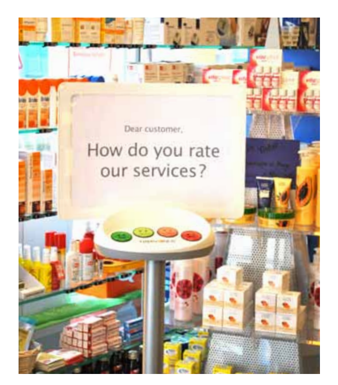
How satisfied are customers with the availability of products?

• Whatever segment HappyOrNot may be deployed in, product availability is always an important matter from the customer's point of view. And only satisfied customers will return.